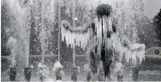
The Legacy Fountain was frozen in time when temperatures dropped on January 3, 2018.