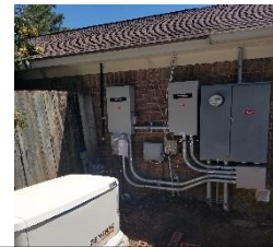
New generator for house

only 1% of hotels rooms equipped with roll-in showers. Therefore, we chose to install a Generac generator to avoid the hustle and bustle of emergency evacuation, and most importantly maintain the HVAC. Oh well, it is only money. Just the other day, both the newspaper and the TV stations ran pieces on the challenges that wheelchair bound persons were still facing with regards to the lack of accessible housing nine months post hurricane Michael. As a result, the generator seems like a wise investment.