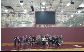
Goal Ball demonstration at FSU

My University of Choice Initiative created a partnership with campus recreation and