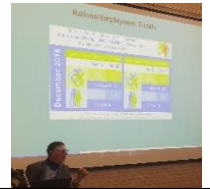
IARP conference January 2019

Presenting at professional conferences is always one of my favorite “HAM activities” and the Southwest International Rehab event in South Florida was most enjoyable. The slide found within the picture captures how far we still have to go for full inclusion in the workforce. The participation rate difference is nearly 40% between those with disabilities and those without. Our unemployment rate is currently 8.9% as opposed to 3.3%.