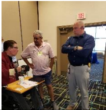
JR talking to participants at Symposium

In May I presented at the Fair Housing Symposium to a group of about 50