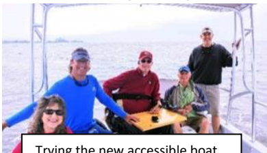
Trying the new accessible boat

A day on the water is always fun and using this new boat design by Bird Dog Boating makes getting off-and-on a lot easier! It is our hope to have a few of these boats