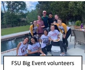
FSU Big Event volunteers

We are most grateful for the annual FSU Big Event. With the help of ten volunteers we were able to get 18 trees replanted, the residual debris removed, and even some much overdue gardening done all in one afternoon late Spring. The Big Event enables hundreds of college students to volunteer throughout the community and provide thousands of much needed community service hours all at the same time. Tree planting made them hungry and Pizza Hut happy with the