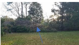
19 th Tree down only 3 left and their time is coming

After three hurricanes in a row (2016, 2017, and 2018), climate change has certainly hit North Florida. Normally Tallahassee is the place everyone comes to hide during storms, but this is no longer the case. As you recall, Erika and I lost 18 trees during Hurricane Michael and the Mexico Beach area was literally wiped off the map. During the January 2019 Tropical Storm, we lost one of our last remaining trees. In all four cases, we lost power for days. Cleaning up after these storms is simply getting expensive and it frustrates me because I have no other choices, but to pay for labor. Also, because finding safe places to stay during storms is very challenging with